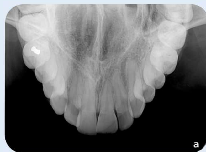
Occlusal - Size 4 PSP