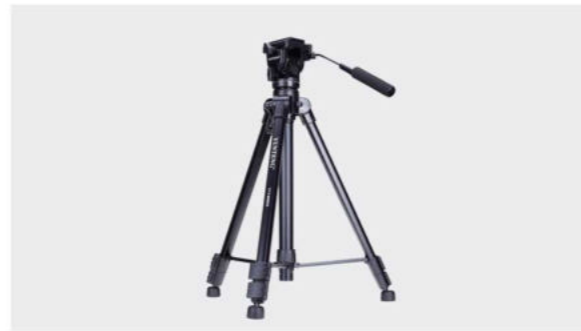
Remote control with a tripod and extended exposure hand brake line