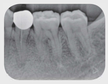
SR / Super Resolution