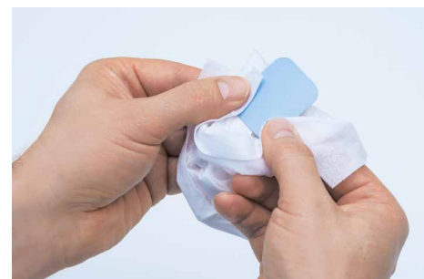
Image Plate Cleaning Wipe

These are perfectly tailored for a digital workflow with image plates or sensors and are also suitable for use with conventional systems.