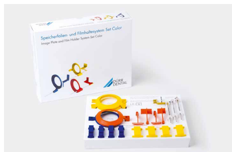
Image plate holder system

Image plate holders from Dürr Dental offer optimum protection for the image plate with their smoothed and rounded edges. Holders are available for all applications – using them helps to ensure that accurate X-ray images are produced.